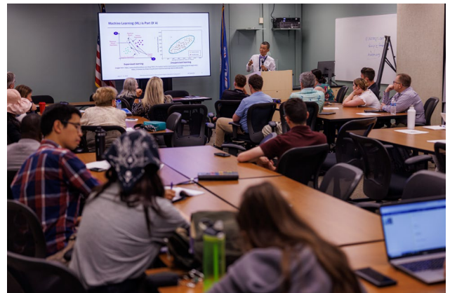
Symposium breakout session.